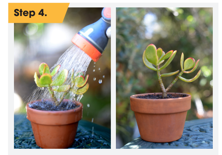
If your succulent is indoors, place it is a sunny position and water it every 2-4 weeks. If it is outside, rainwater is usually enough!