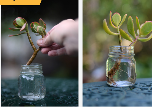
Place the clipping in a jar of water with the root submerged. Position the jar in a sheltered location until you see roots start to form.